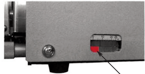
Partial Strip Indicator